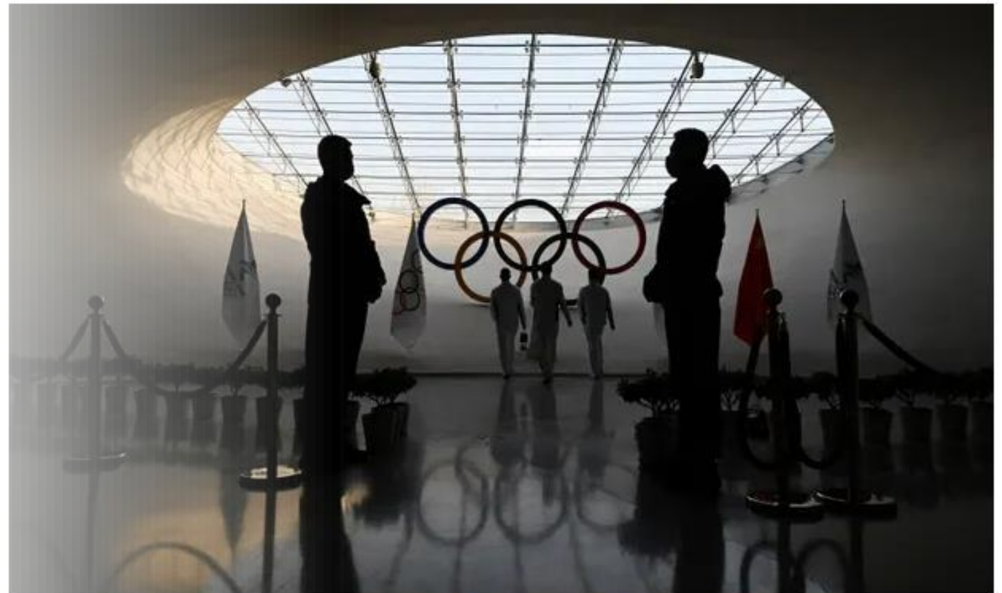
Security guards stand by as workers refuel the Olympic flame in the Olympic Tower in Beijing on Monday.

A year bookended by the Beijing Winter Olympics and the Fifa World Cup in Qatar could be a high point of authoritarian regimes looking to cover up their dismal human rights records